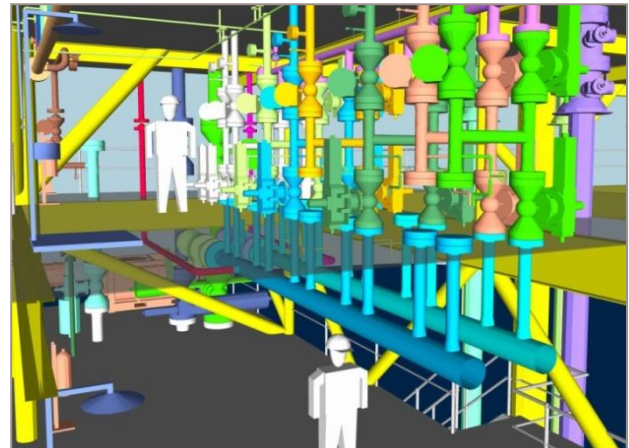
Hydraulic actuators controlled from the central processing platform will adjust well flows by activating choke valves or by diverting the product streams between manifolds. Injection of chemicals is achieved by the same method

ICON's work in Perth commenced with a conceptual proposal to meet client requirements that the wellhead platforms be unmanned, remotely controlled, with a minimum period of three months between personnel visits. The multi discipline team continued through process design and basic layout to piping, electrical, instrumentation and