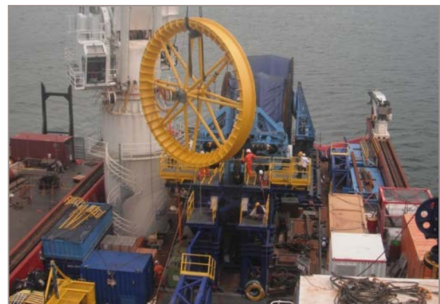
ICON Flexible Pipe Lay System during Mobilisation