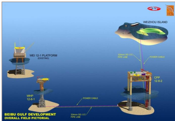
Overall Field Development

The initial development consisted of a 4 slot wellhead platform at 12-8 West (12-8-1) and an unmanned "hub" facility at 12-8 East (12-8-2). The oil was to be pumped via pipeline to custody transfer at Weizhou Island.