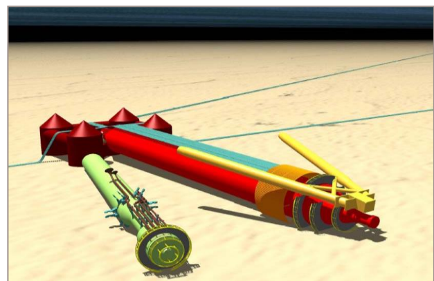
Seabed Image Produced for Government Submission

Seabed dumping permits were obtained for the Challis SALRAM and Jabiru RTM in 2004 and 2011 respectively. The Jabiru field ceased production in 2010. Largely in line with the ICON study recommendations, wells were plugged and abandoned by MODU of convenience in 2011, the FPSO was removed in 2011, MDBs were moved to the Challis location and disposed on seabed, flowlines and FPSO moorings were disposed insitu.