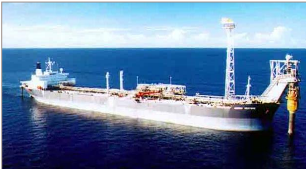
Jabiru Venture FPSO Connected to RTM

The Jabiru Venture (pictured below) is a 140,000 Dead Weight Tonnes Floating Production, Storage and Offloading facility.