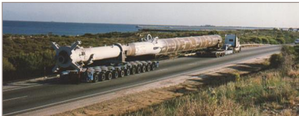
Substructure Road Transportation to Jervoise Bay Loadout Site

The 4 x 135 tonne topsides and 4 x 140 tonne sub-structures were fabricated in the Perth metropolitan area. The substructures were transported from Perth to site together on a barge and installed using the jackup drilling rig "Hakuryu 9" in a single installation phase.