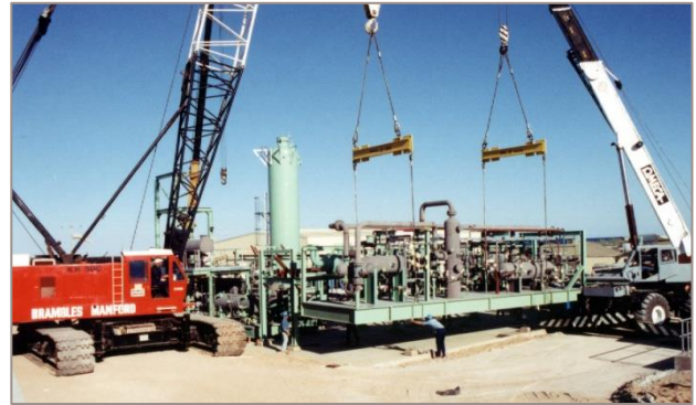
The gas plant was modular and skid mounted to minimise the installation time and cost

A gas treatment and compression plant capable of handling up to 20mmscfd of gas was constructed adjacent to the existing oil treatment facilities on Thevenard Island.