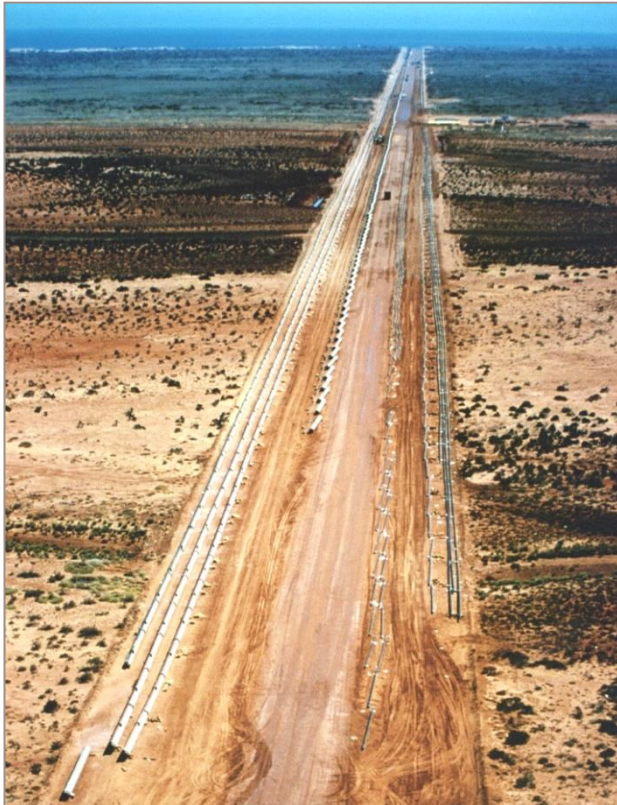
View of the pipeline string site at Tubridgi where the pipeline strings were made up prior to towing to site

The 508mm oil pipeline and the 168mm gas pipeline were constructed using the bottom tow method. An onshore stringing site, some 4.5 kms long, was set up at Tubridgi, approximately 10km from the Roller field.