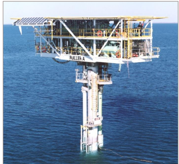
The completed Roller A platform

Detailed installation procedures aimed at reducing construction risk allowed each complete platform to be installed in an average of 6 days.