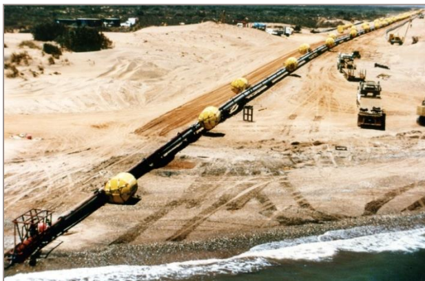
Pipeline bundle with flotation & pull head ready for tow