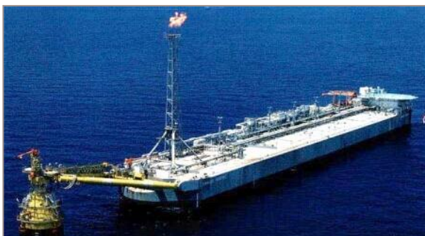
Challis Venture FPSO connected to RTM