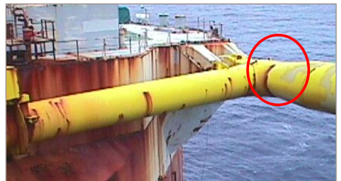
Possible Yoke Cutting Location

Our naval architecture group also analysed the SALM in a free floating condition under tow to a scrapping location.