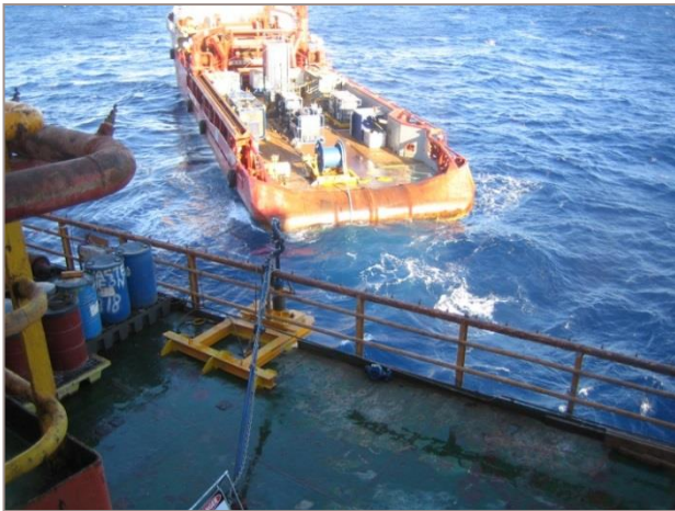
Gravel Pack Spread in Operation

ICON Engineering was contracted by Woodside Energy Limited (WEL) to undertake the engineering design, detailing and installation of sea-fastenings to Schlumberger equipment on the Far Stream Anchor Handling Tug Supply Vessel. This work was required as part of WEL gravel packing operations on the Enfield Development on the North West Shelf, and was the first gravel pack conducted from a work vessel in Australian waters.