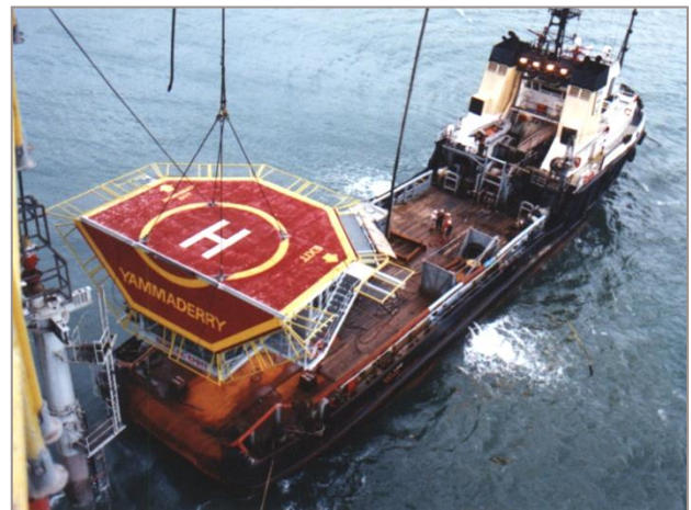
Yammaderry Topsides Installation