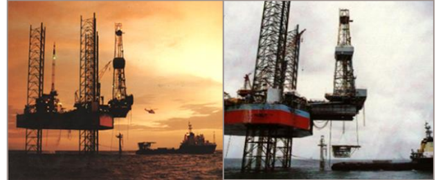
Dawn before topsides lift-off. Mooring and lift takes less than 4 hours

clearances between the rig, the structure and the edge of the topsides on the transport vessel.