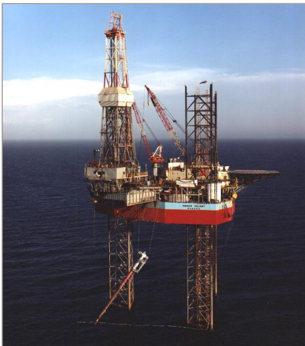
Upending the Substructure

The substructure was lifted from the transportation supply vessel horizontally and upended using the rig's draw works. The structures were installed into foundation holes drilled using reverse circulation techniques. They were then grouted into place.