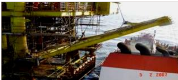
Brace being installed on existing BKC Platform

Detailed design of the platform was undertaken by TML's engineering contractor in Malaysia with review and assistance from ICON.