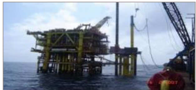
Brace being installed on existing BKC Platform