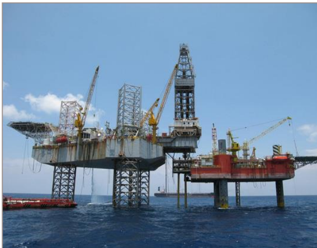
Similar Development Illustrating the use of a WHSF

The wellhead support frames (WHSF) at D30 and Dana will be located in approximately 45m of water offshore Sarawak.