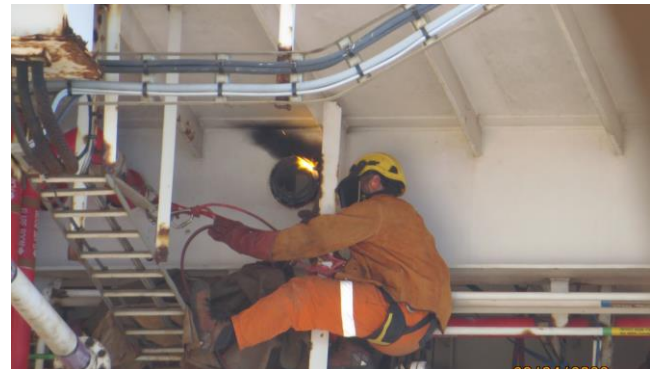
Rope access boiler maker welders

ICON also completed the design, fabrication and installation of a new mud return line from the starboard wing deck up to the MODU's flowline underneath the drill floor. ICON routed the new line, facilitated model reviews and then went on to complete detailed design, fabrication and installation of this line.