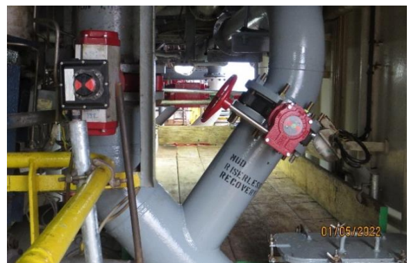
New MRL tie into rig flow line

The Mud return line was also completed with a multidisciplinary ICON piping installation team by using both scaffolding and rope access and the line will remain on the MODU as a permanent upgrade for future campaigns.