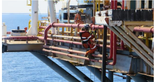
Riserless Mud Return Line

on the MODU including all pipe welding, support fabrication, NDT, pressure testing and touch-up paint.