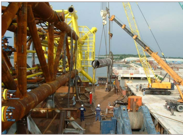
Seafastening of Jacket & Fitting of Lift/Upending Rigging

The jacket was fabricated at Lumut by HL Engineering.