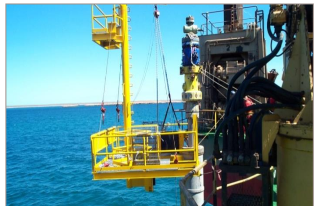
Installation of the topsides structure on the caisson